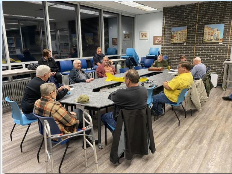
The meeting in progress.