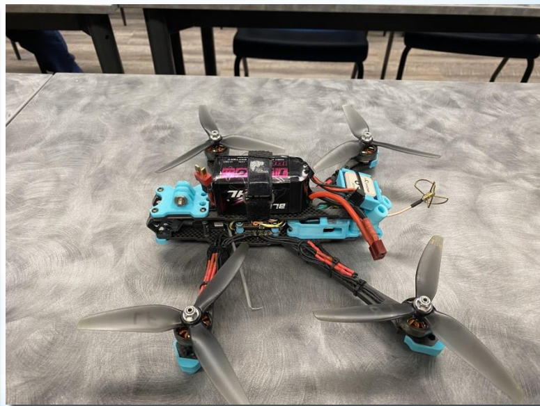
Joe Dantonio's 6" freestyle quad, the Axis Manta, from Race Day Quads.