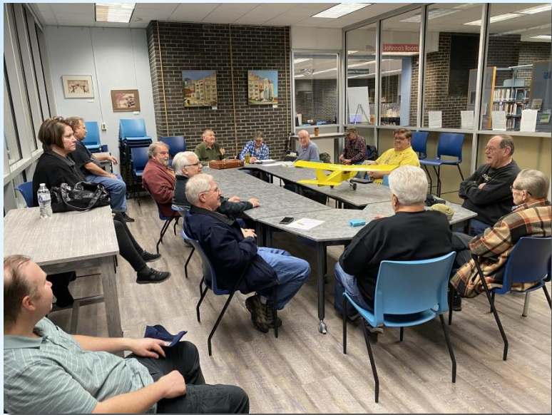
The meeting in progress.

Photos from show and tell at February's meeting.